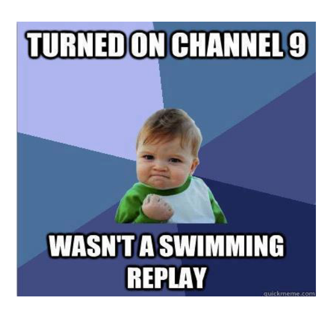
Figures 4,5 (Above) and 6 (Over). Memes about Channel Nine's swimming focus.